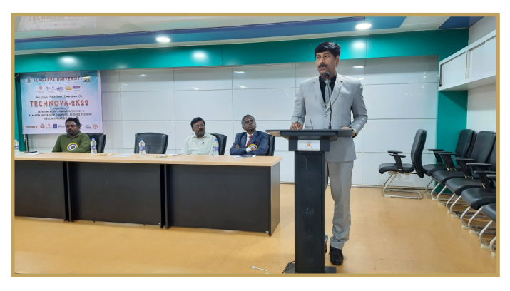
Two-Day Symposium (TECHNOVA - 2022) Conducted

The Department of Computer Science, Alagappa University, conducted a Two-day Symposium (TECHNOVA - 2022) for UG level college students pursuing Computer Science as a major subject on 27th and 28th October 2022 at the Science Campus Seminar Hall.